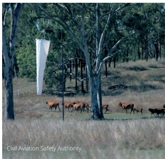
Civil Aviation Safety Authority